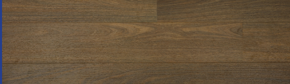
NORTHERN SPOTTED GUM